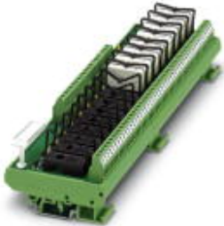
VARIOFACE module, for 16 plug-in miniature relays or miniature optocouplers, with LED, 230 V AC input voltage

Please be informed that the data shown in this PDF Document is generated from our Online Catalog. Please find the complete data in the user's documentation. Our General Terms of Use for Downloads are valid ( http://phoenixcontact.com/download )