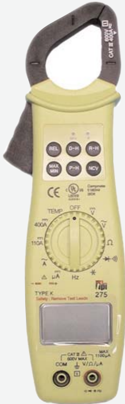
10" x 1.3" x 2.5"