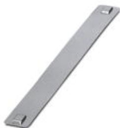
Carrier for conductor marking collar, silver, unlabeled, mounting type: Assembly with cable binders, cable diameter: > 16 mm, lettering field size: 92 x 10 mm

Please be informed that the data shown in this PDF Document is generated from our Online Catalog. Please find the complete data in the user's documentation. Our General Terms of Use for Downloads are valid ( http://phoenixcontact.com/download )